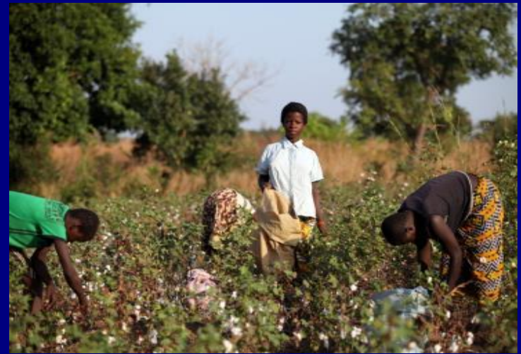
Cotton harvest in Burkina Faso