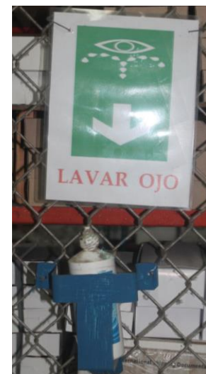
Figure 3: Inadequate Eyewash Station

In addition, contrary to accepted safety standards, 39 the factory does not provide adequate eyewash facilities in case of exposure to acid solutions that are used in the factory’s generator room for recharging batteries. The nearest eyewash equipment to the generator room is a bottle of eye rinse solution which is kept in the factory’s maintenance shop, which cannot be accessed from the generator room within ten seconds and thereby fails to meet safety standards. Finally, the bottle of eye rinse solution holds only sixteen