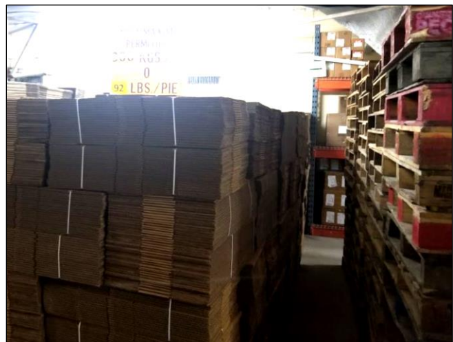
Figure 4: Combustible Cardboard Boxes and Wooden Pallets Stored in Sewing Facility Mezzanine

The WRC's health and safety specialist observed that, in violation of legal standards, 46 large quantities of combustible materials, such as wooden pallets and cardboard boxes, were being stored in the mezzanine of the sewing facility ( See Figure 4 ), and combustible fiber dust had been left to accumulate on some utility pipes.