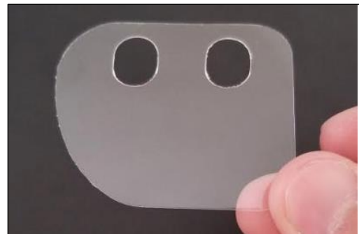
Figure 5: Inadequate Side Eye Protection

Moreover, while some workers are provided with appropriate (i.e., NIOSH N95) respirators, contrary to the requirement that these respirators be stored away from airborne contaminants, some of these were being kept improperly near the stain removal work area. Finally, the safety eyewear provided to workers who use corrective eyeglasses failed to meet legal requirements, because they lacked properly fitting and fully protective side panels ( See Figure 5 ). 49