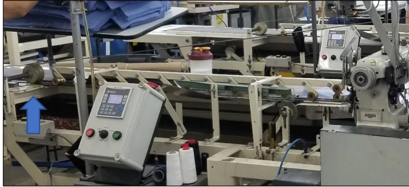
Figure 1: Unguarded Belt Drive on Sewing Equipment

While sewing, cutting, and spreading machinery at RKI generally had guarding installed to protect the workers who operated it, the WRC's health and safety specialist observed that the belt drives for the pulleys on some machinery in the factory's sewing section