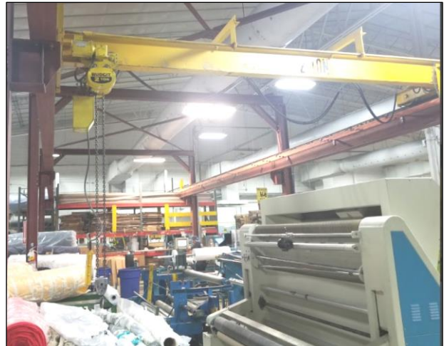
Figure 7: Stationary Crane/Hoist in Cutting Department

RKI should provide specific training for workers who operate cranes and hoists on the safety hazards associated with and the safe operation of this equipment.