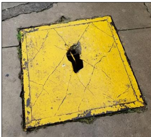
Figure 8: Trip Hazard outside Sewing Facility

The WRC’s health and safety specialist observed tripping hazards, including broken surfaces and coverings for utility access, around the exterior of RKI’s facilities, which violated Honduran workplace safety standards ( See Figure 8 ). 56 RKI’s management informed the WRC that the