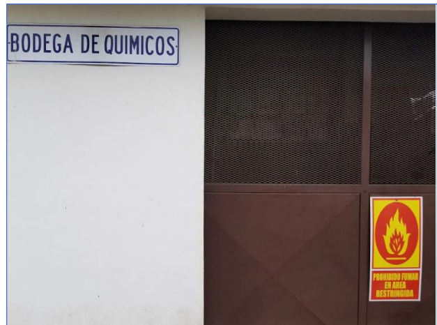
Figure 2: Chemical Storage Facility without Eyewash Shower

The WRC's health and safety specialist found that the company is consistent in ensuring that chemicals are properly labeled and that material safety data sheets are posted with information concerning the chemicals in use in the facility. Moreover, chemicals are properly stored in dedicated areas, with secondary containment for spills. However, as discussed below, the specialist also observed that the company had failed to install adequate facilities in some areas for employees to wash their eyes in case of chemical exposure (See Figure 2).